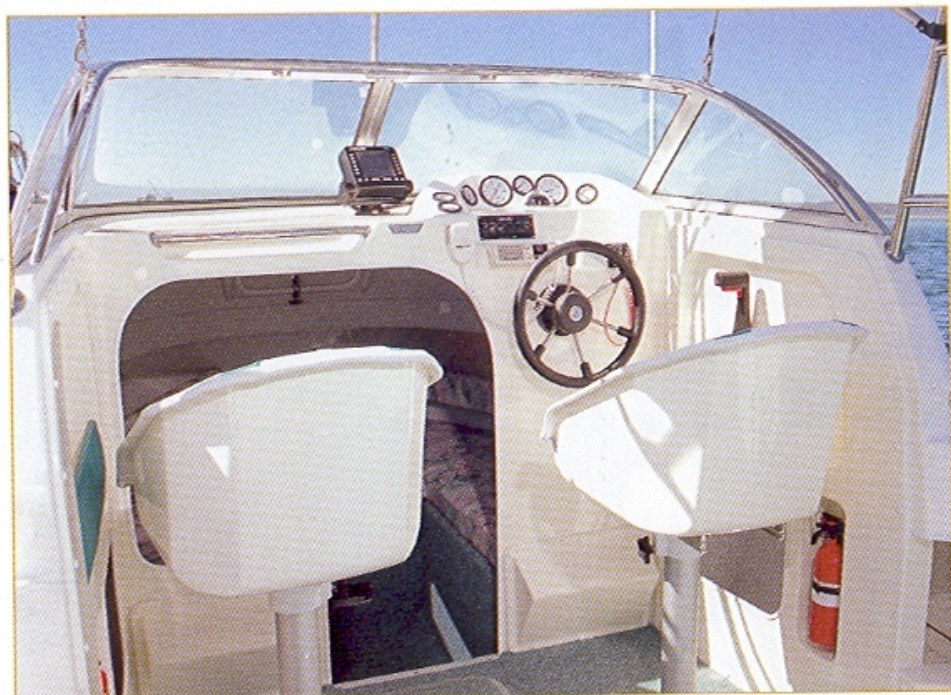
1 A helm station to accommodate all your electronics - right where you need them. Note 2-way radio and fire extinguisher positions. Optional stainless steel windscreen rail for added security with the glass windscreen.