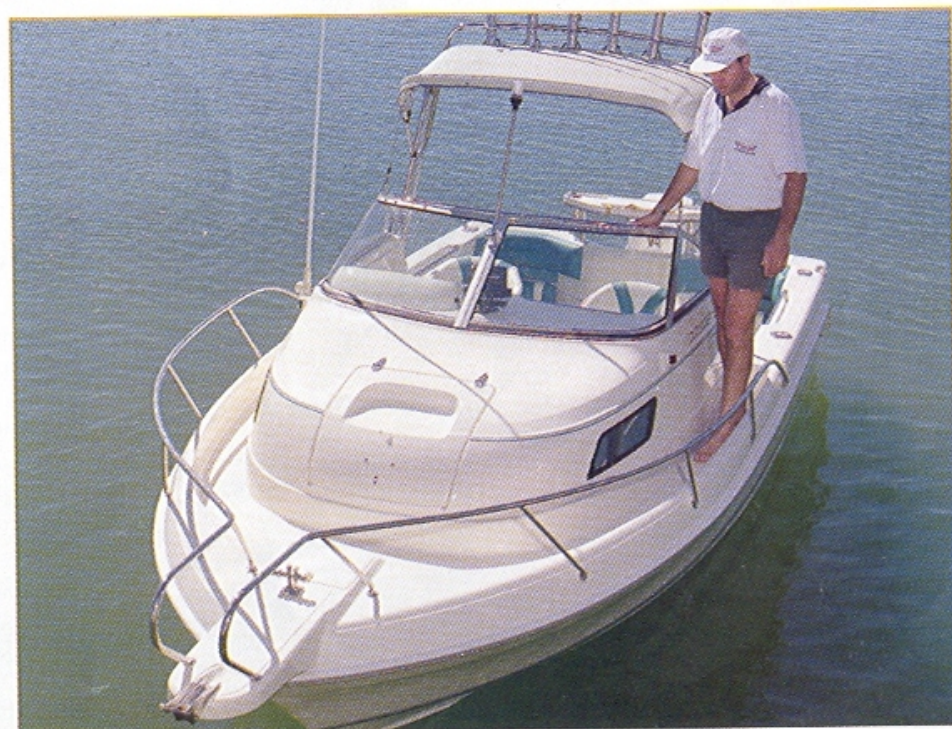
4 Walkaround side decks give safe and secure access to fore deck. Note access hatch with inbuilt seat, bow sprit with bollard and roller fairlead plus the security of a stainless steel bow rail.