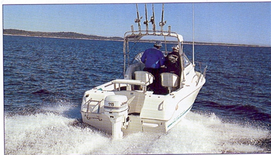
3 Transom step and handle for easy access aboard. Engine motor well will accommodate up to 150hp with 25" leg. Optional stainless steel boarding ladder.