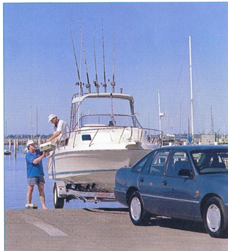
Towing is a dream, behind the family car that has a 1500kg capacity.

Please Note: Photographs and text may refer to non-standard specifications and fittings. The manufacturer reserves the right to change specifications and fittings without notice.