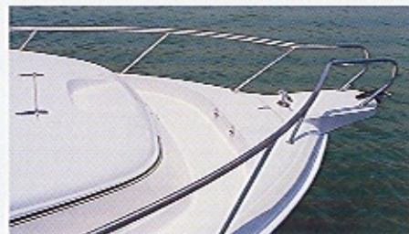
Anchor locker incorporating bow sprit, access hatch incorporating seat, sturdy stainless steel bow rail.