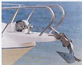
Optional Electric Anchor Winch.