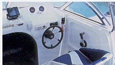
Integrated dash for engine monitoring system, communications and electronics.