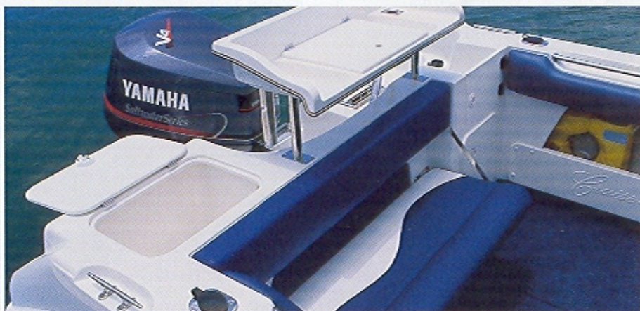
Foldaway Rear Lounge with backrest, tank with hatch for live bait, optional deluxe bait preparation board.