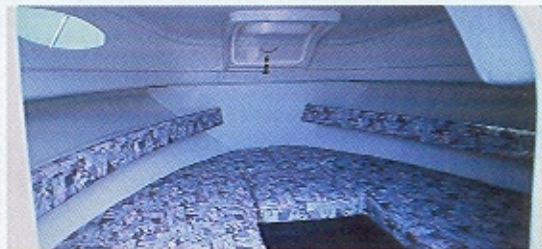
Large cabin with side windows for light, provision for chemical toilet and storage shelves.